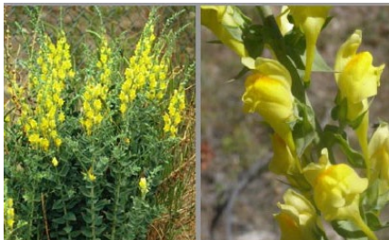
Dalmatian toadflax ( Linaria dalmatica )