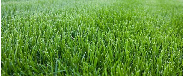
Eg. Traditional lawn