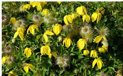
Yellow clematis ( Clematis tangutica )