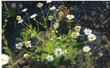
Scentless chamomile ( Matricaria perforate )