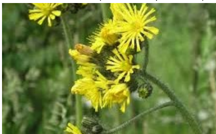
Yellow hawkweed ( Hieracium pretense )