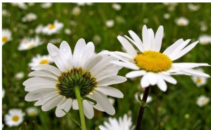
Oxeye daisy ( Chrysanthemum leucanthemum )